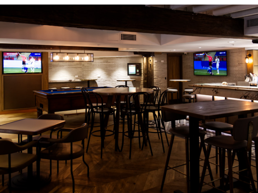
Cheers Bar and Grill

As a long-term partner and supplier to Harvey Norman, Ambertech were contacted by the shopfitting contracted electrician to assist in the specification and design of a full 4K (HDMI 2.0/18 gig) uncompressed distribution system using Wyrestorm, capable of distributing across over 100 displays comprising of both 4K and 1080p screens and no less than eight different TV brands.