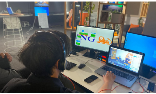
ING Australia Studio Build