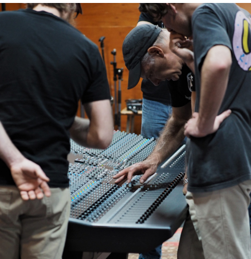
Damien Gerard Studios